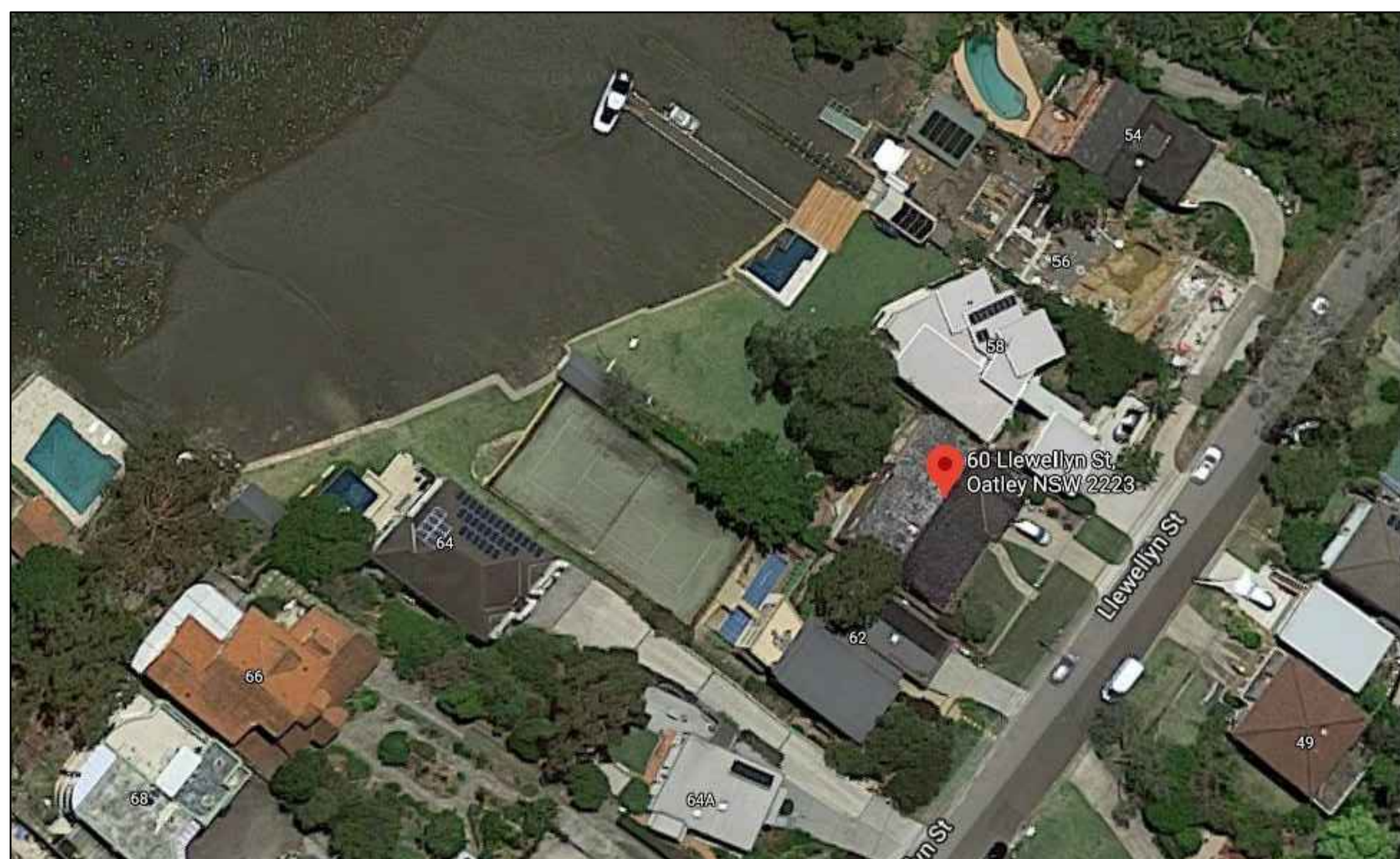
AERIAL PHOTO SCALE: NTS