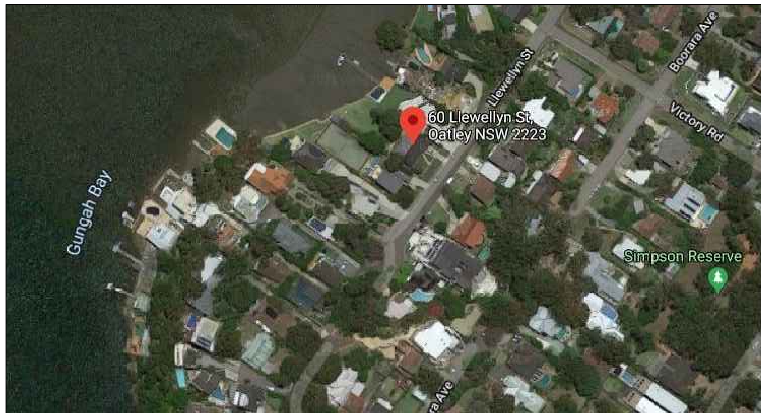
LOCALITY PLAN SCALE: NTS