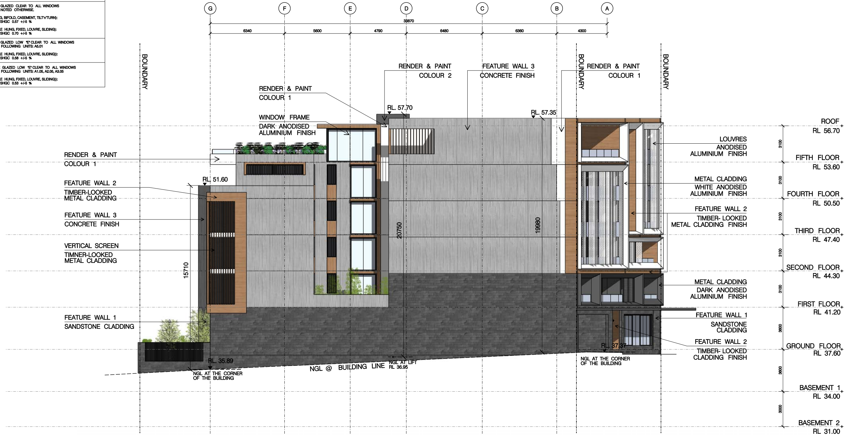
01 NORTH EAST ELEVATION SCALE 1:200 @ A3