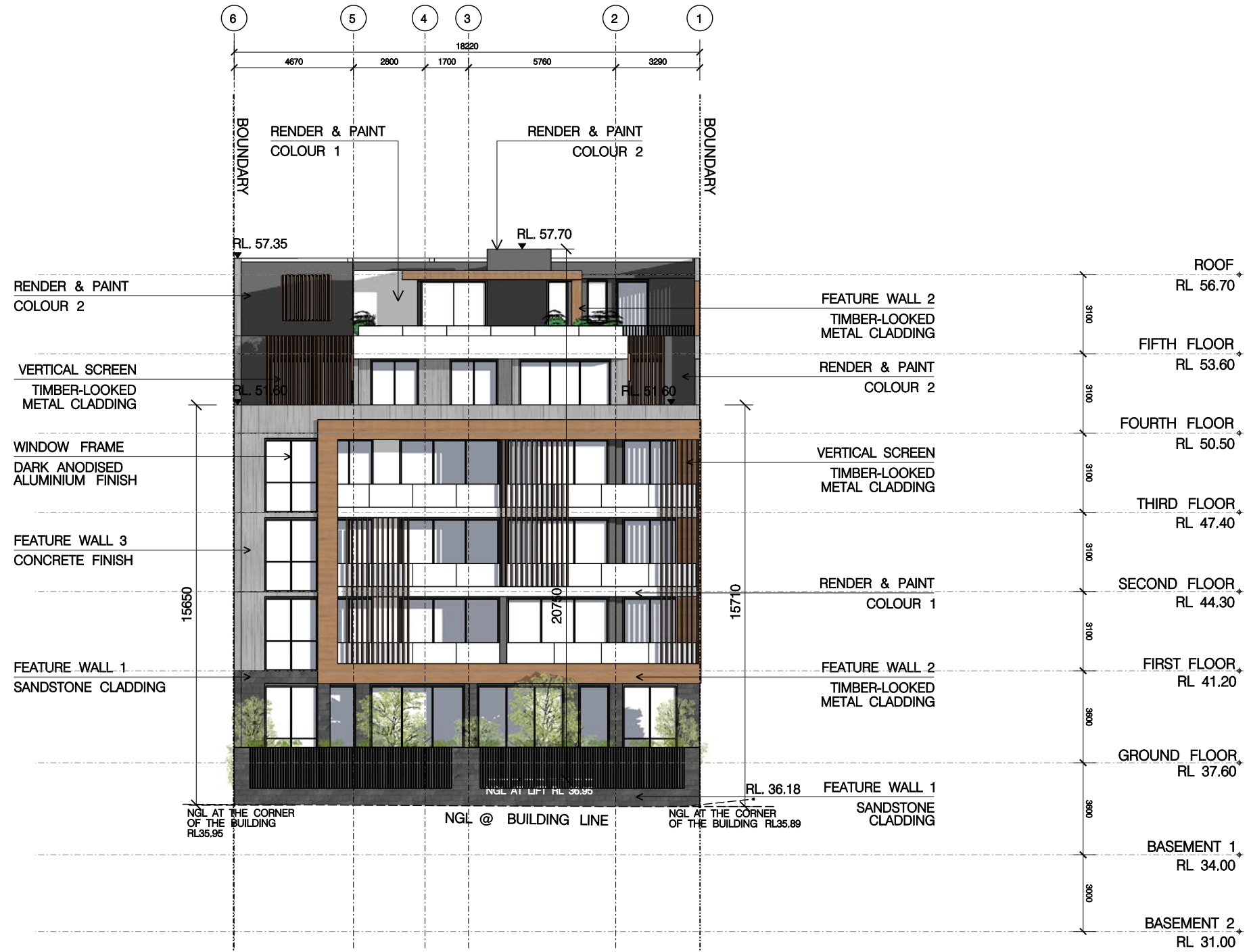
01 SOUTH EAST ELEVATION SCALE 1: 200 @ A3