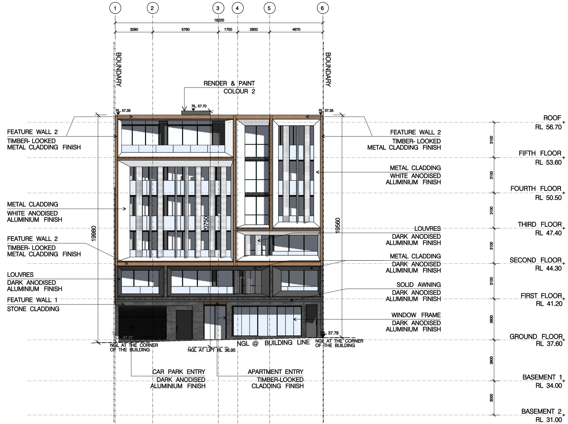
01 NORTH WEST ELEVATION (RAILWAY PARADE) SCALE 1: 200 @ A3