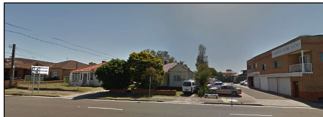
View of Neighbouring Sites - 62, 64 & 66 Park Road