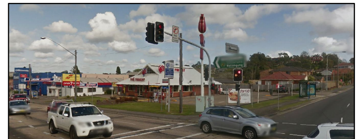
View of Neighbouring Sites - 372-381 Princes Highway 'Red Rooster'

NOTE: REFER TO CLOUDED AREA'S FOR CHANGES