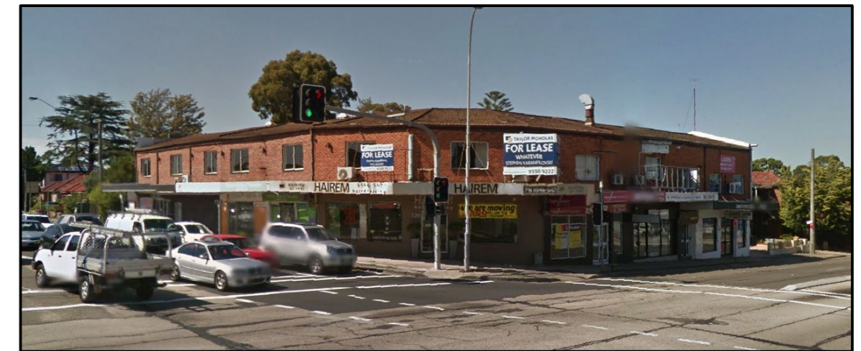
View of Neighbouring Sites - 220-225 Princes Highway