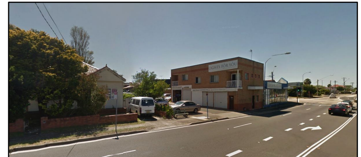
View of Subject Site from the corner of Park Rd