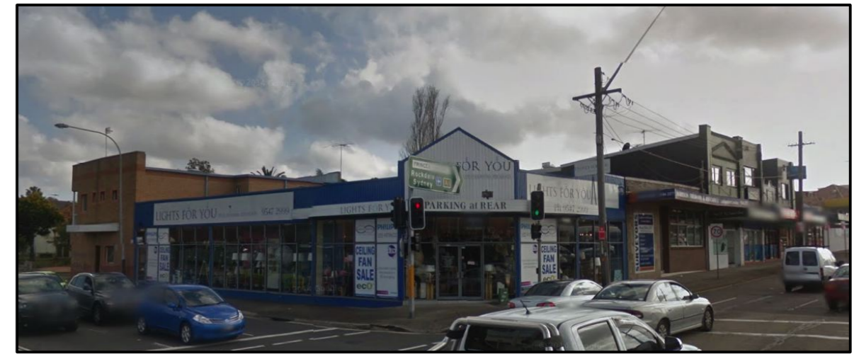
View of Subject Site from the corner of Park Rd and Princes Highway